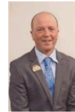
Cr Tony Ciccio Elected to Council 2016