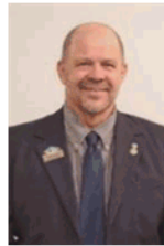
Cr George Weston Deputy Mayor Elected to Council 1995